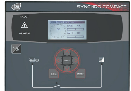
SWITCHBOARD MOUNTED VERSION WITH DISPLAY